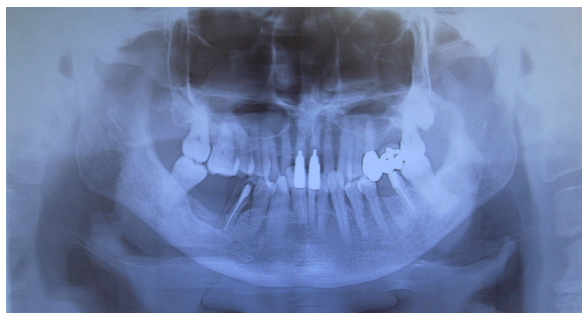
Figure 1: A dental panoramic radiograph taken at the time of presentation.

However, the patient visited our clinic again in August 2015 complaining of a quivering pain. Rikkosan was administered again, but was not effective. He complained at this time that he could not eat his meals because of the pain. In October 2015, his visual analog scale score for spontaneous pain was 32 mm and that for occasional shooting pain was 70 mm. His pain changed 2 weeks later: he felt irregular spontaneous pain for 15 minutes, without experiencing pain at meals. His pain was worse at night. These symptoms were not improved by treatment with traditional Japanese medicine, i.e., Keishikajutsubuto (TJ-18), Goreisan (TJ-17), and Rikkosan (TJ-110).