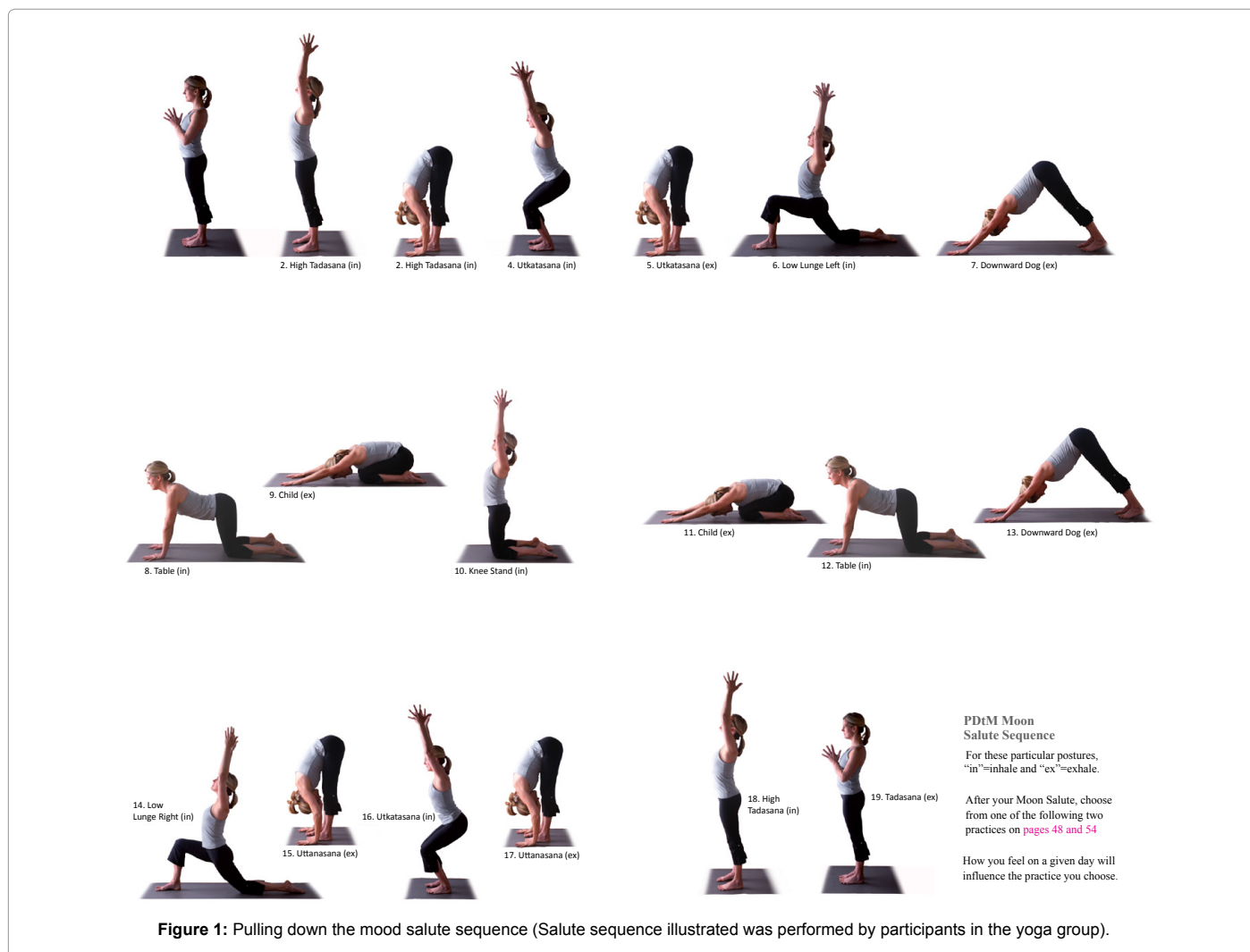
Figure 1: Pulling down the mood salute sequence (Salute sequence illustrated was performed by participants in the yoga group).

One hundred eleven participants were recruited. Within the yoga group, 65 participants were recruited however only 55 were analyzed (10 were excluded because they did not complete both survey time points). Within the control group, 46 were recruited however only 24 were analyzed (22 were excluded because they did not complete both survey time points) (Figure 2).