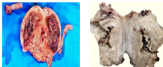
Figures 1 and 2: Cut section of subtotal hysterectomy specimen showing upper segment placenta increta.

procedure. She had a bout of bleeding six hours after evacuation with a blood loss of around 100 mL. An emergency sonography was done in the radiology department in order to rule out RPOCs or placenta accrete. It revealed an ill-defined hypoechoic area 4.4 cm × 2.2 cm s/o clot in view of no internal vascularity but was advised MRI for further confirmation which was scheduled for next day. However, she had another bout of bleeding with loss of around 800 mL blood on the same day leading to compensated hypovolemic shock. Hence patient was taken up for emergency subtotal hysterectomy. Uterus with bilateral fallopian tubes were removed and sent for HPE. On cut section, a rough area seen with some adhered bits of placental tissue an anterior wall of uterine body (Figures 1 and 2). On histopathological examination, it was reported to be a focal placenta increta, chorionic villi invading myometrium were seen in upper part of anterior surface of body of uterus (Figure 3). Bilateral fallopian tubes were unremarkable. Histopathology of tissue obtained after evacuation was also reported as normal products of conception. Postoperative period was uneventful and patient was discharged after suture removal.