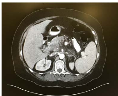
Figure 2: Abdominal CT revealing a mass on the dorsal aspect of the pancreatic head.

PVT is a previously established complication of pancreatic cancer [4]. In a study performed by Digestive Diseases and Cancer Institutes, the frequency of PVT and venous thromboembolism in patients with pancreatic cancer was investigated. It was observed that PVT occurred