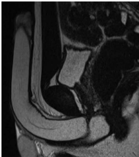
Figure 2: Normal penile MRI (under vasoactive drugs).

The penile ultrasound showed a plaque at the distal portion of the right corpus cavernosum associated to an intracavernosal hyper echogenicity (Figure1), as if it could be an intracavernosal fibrosis. Consequently, a penile Magnetic Resonance Imaging (MRI) under vasoactive drugs was performed, with normal results and without any suggestive finding (Figure 2).